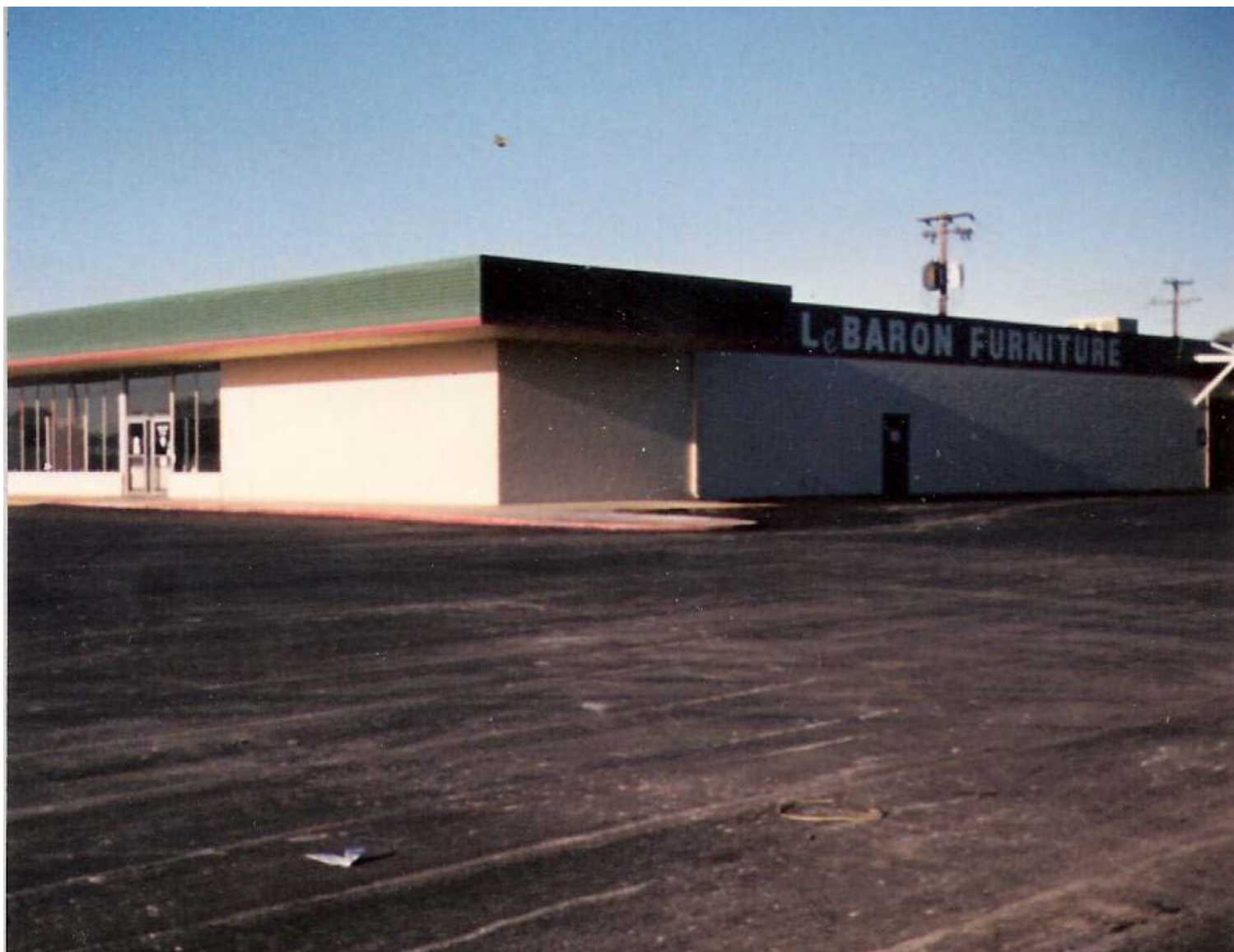
Before the Transformation to a Library