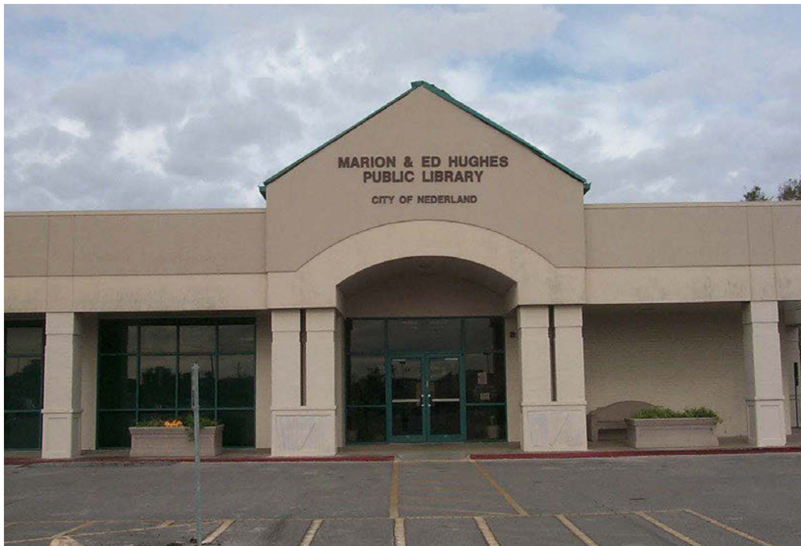
Library at 2712 Nederland Avenue