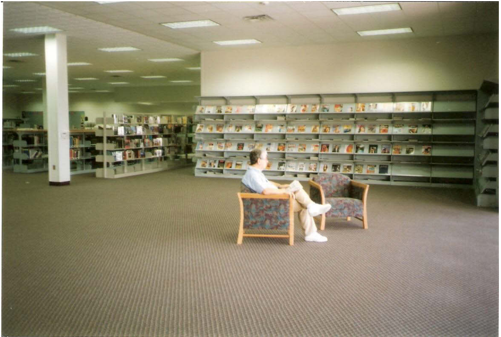
Reading Area in September 1998 when New Library first opened.