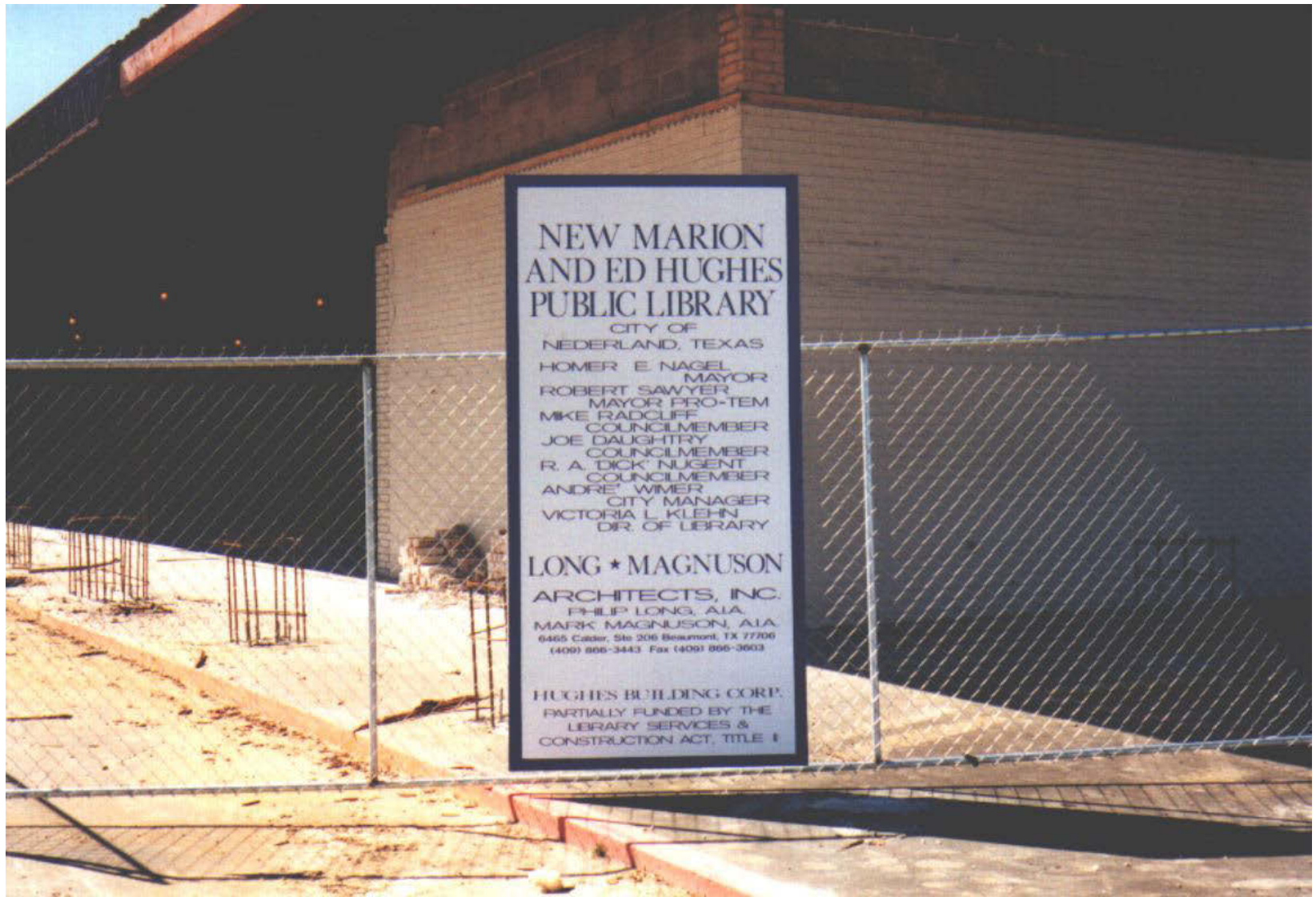
Construction Begins on Nederland Avenue Building. The New Facility will be 16,000 Square Feet. Four Times the Size of the Atlanta Avenue Building -- 1997