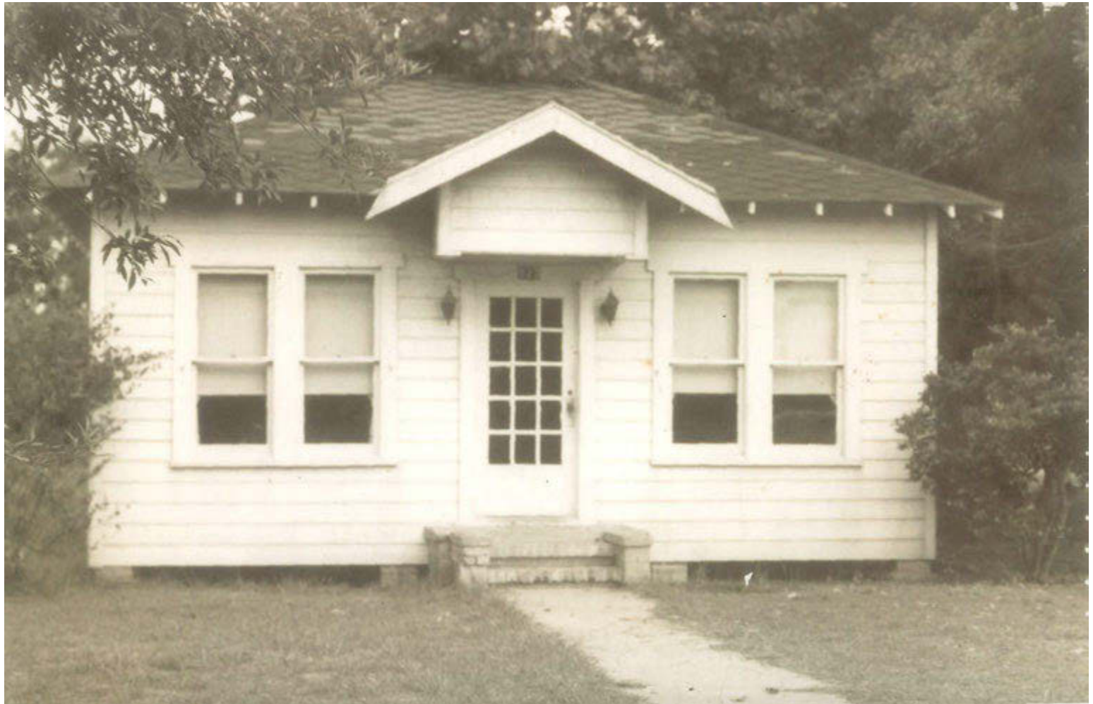
Nederland Branch Library