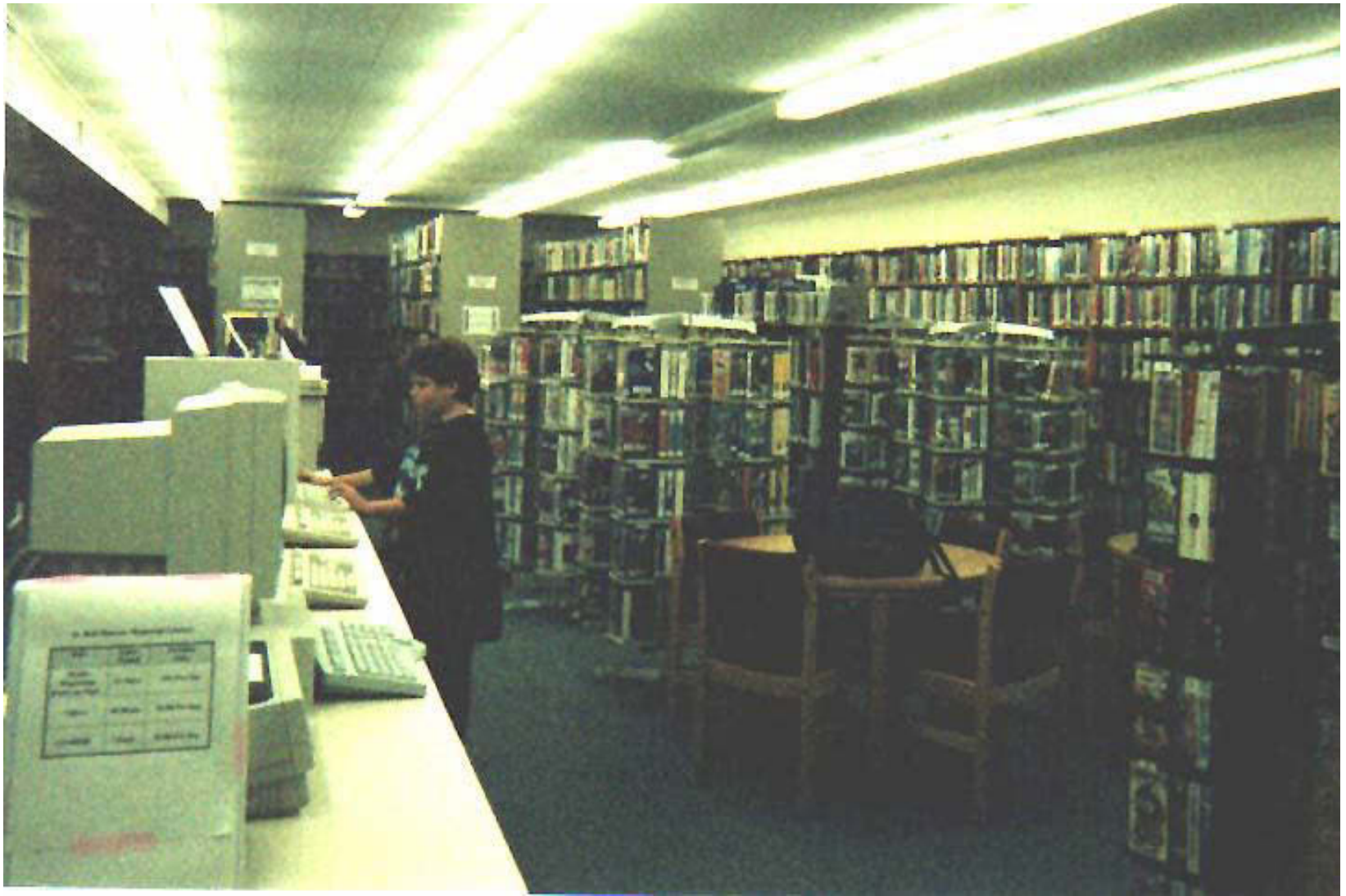
No Andre, There Is No Card Catalog, We're Computerized Now -- 1994