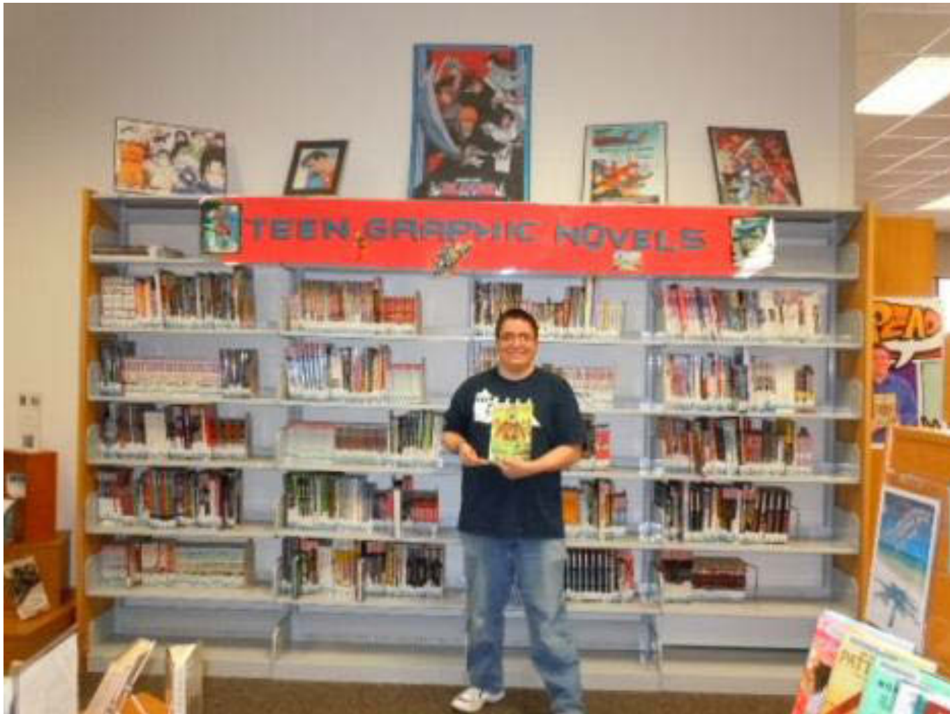
Graphic Novels are a big hit with Teens