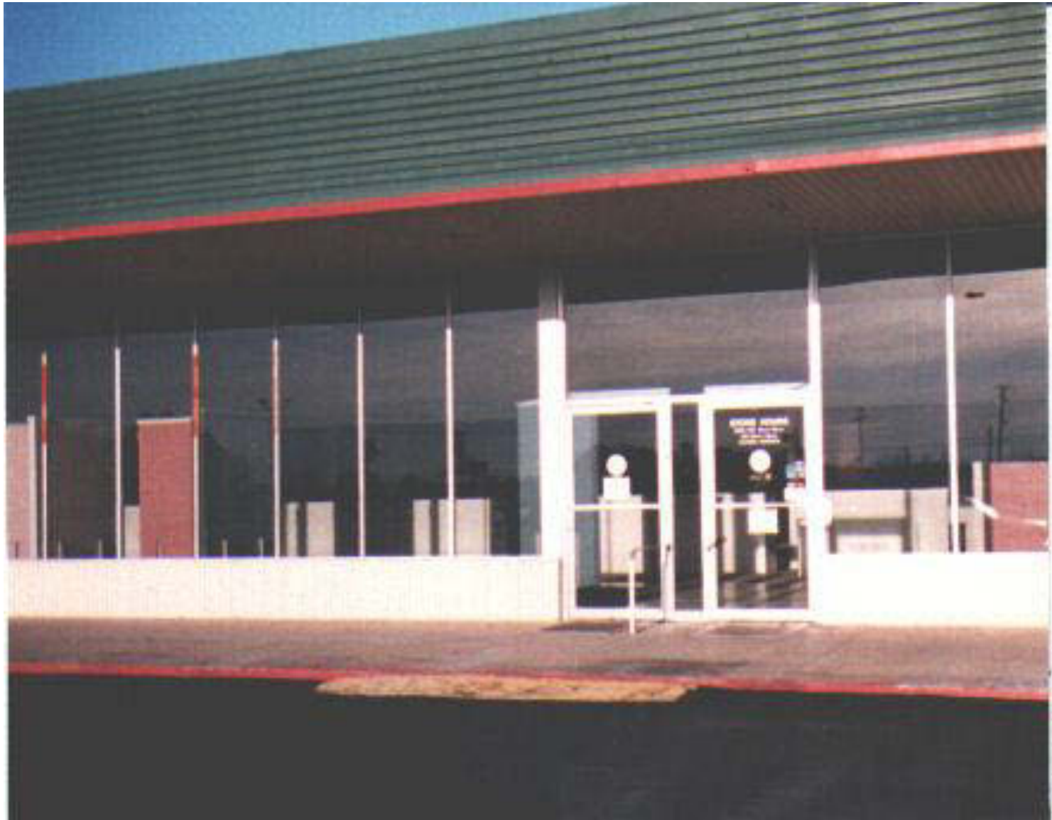
Nederland Avenue Building Before It's a Library -- 1996