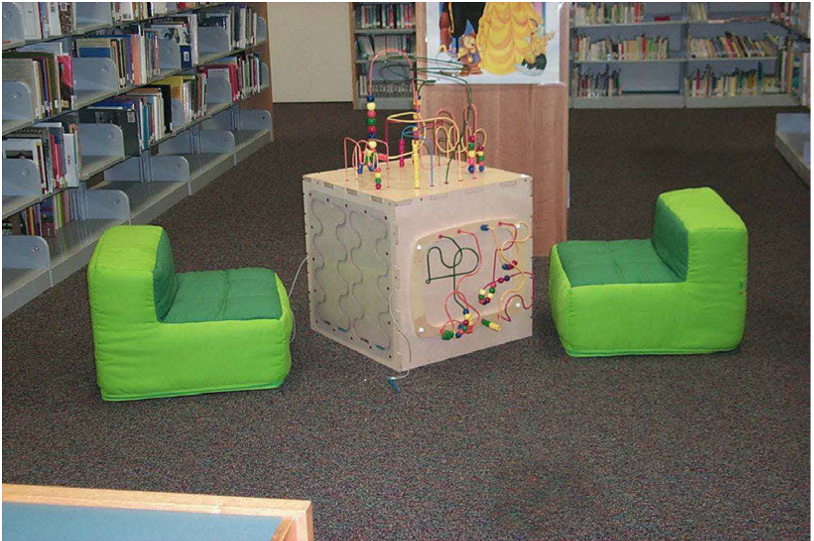
Comfy furniture and activity cubes in the Easy Reading area