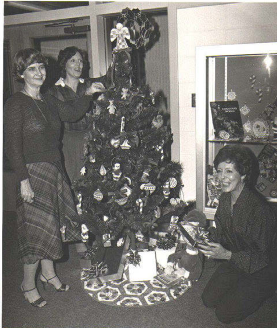
Members of the Friends of Library Decorate Christmas Tree