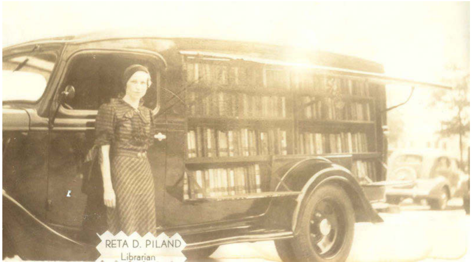
In the Beginning, Bookmobile Visits Nederland