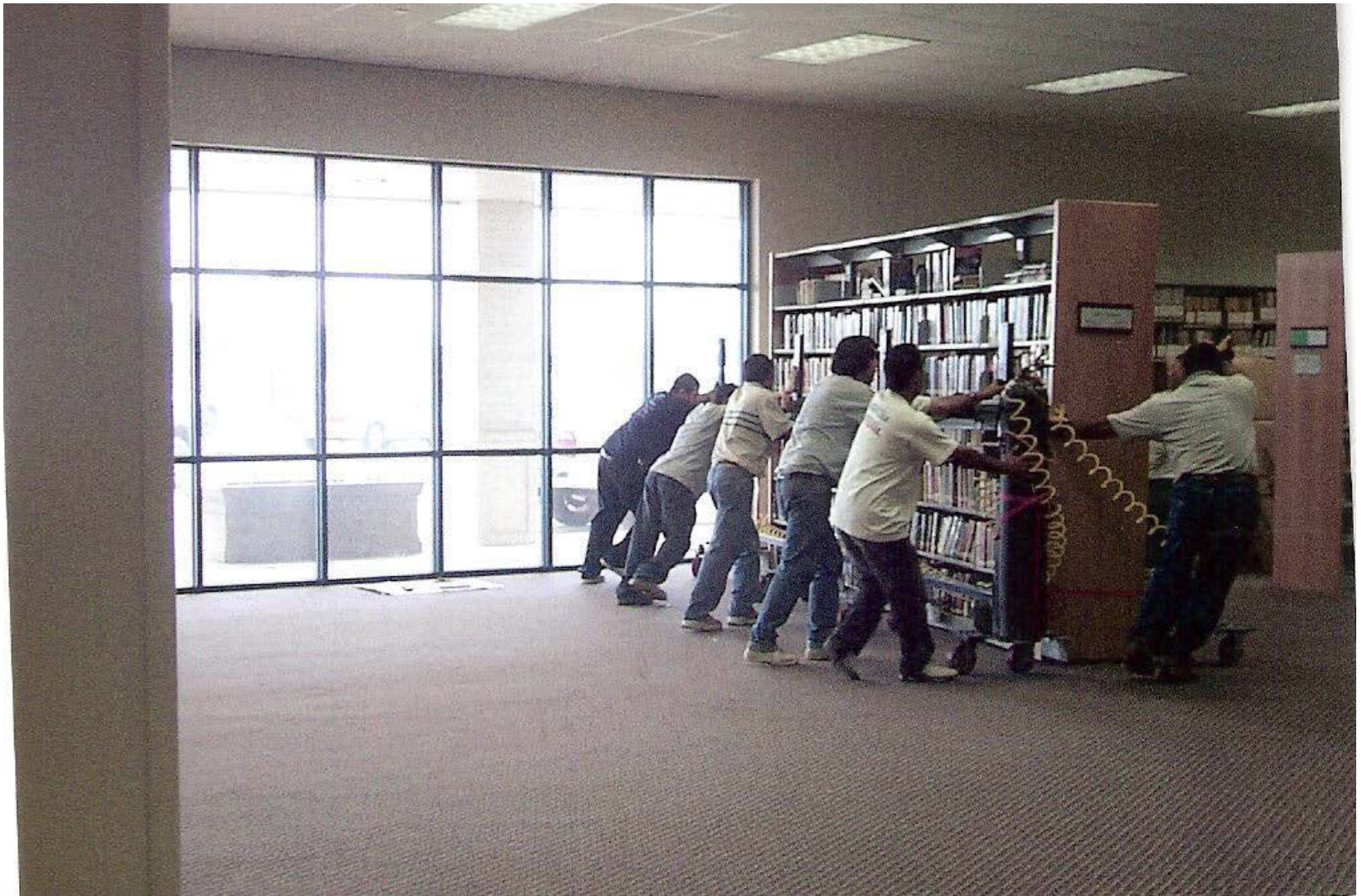
Moving shelving units to lay new carpet after Rita, March 2006. In previous years, we would have used book trucks to move the books and dismantled the shelves.