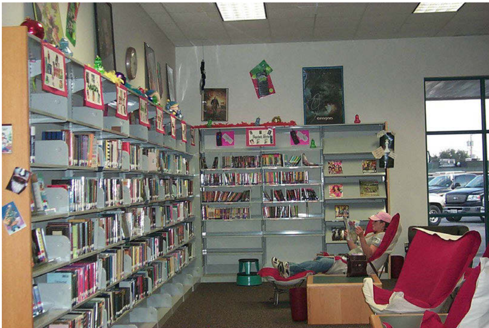
Reading Area after conversion to Teen Space. Furniture and promotional materials were obtained from donations from the Friends and a Praxair Foundation Grant.